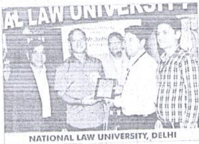
NATIONAL LAW UNIVERSITY, DELHI