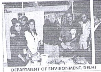
DEPARTMENT OF ENVIRONMENT, DELHI