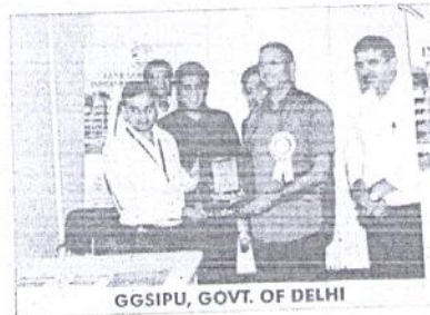
GGSIPU, GOVT. OF DELHI