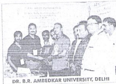
DR. B. R. AMBEDKAR UNIVERSITY, DELHI